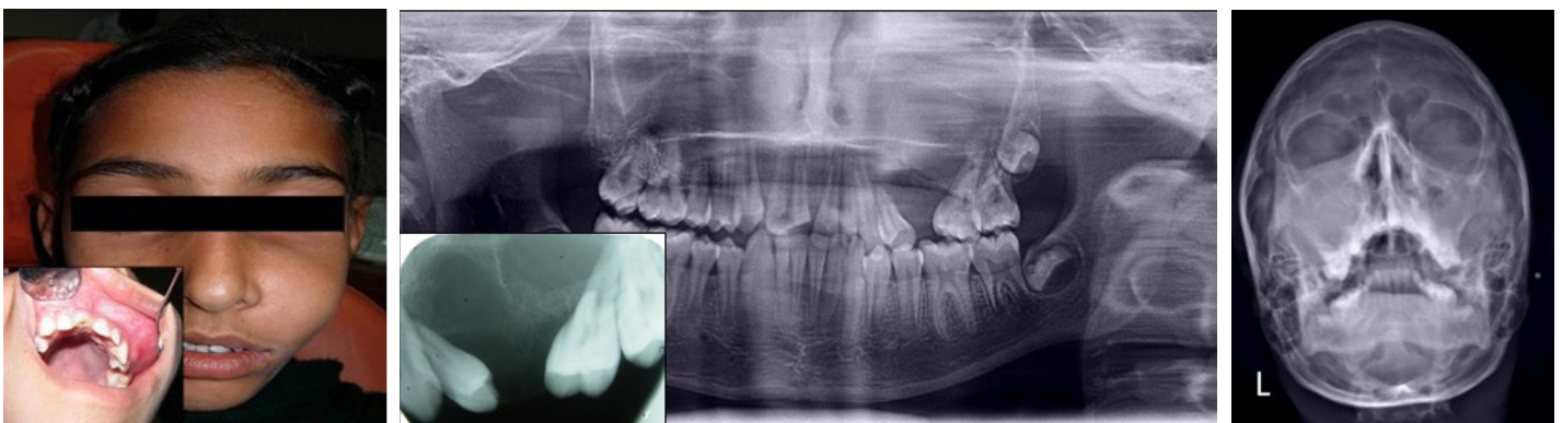
[Table/Fig-1]: Photograph showing swelling in the left anterior maxillary region. Inset showing an expansion of the buccal cortical plate with normal palatal borders

Microscopic examination revealed spindle shaped cells in a collagenized stroma. The architectural arrangement of the spindle cells varied with groups of cells arranged in storiform to parallel fashion, mixed with short interlacing fascicles and intertwining strands [Table/Fig-4]. The nuclei of these cells were uniformly bland with rare mitosis and no cytological atypia. Few round to oval cells with vesicular nuclei were present in one area of the field which